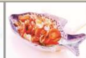
PRIG PAO TALAY