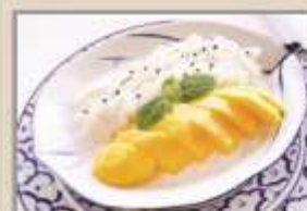
STICKY RICE W/ MANGO

F.B.I. (Fried Banana With Ice-Cream) $7.95