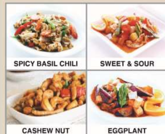
SPICY BASIL CHILI

41. MIXED VEGETABLES $11.95 Sautéed mixed vegetables and mushrooms in garlic sauce.