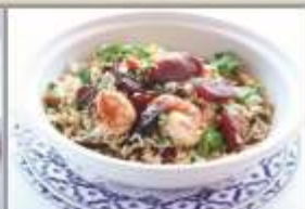
KHAO OB KHUN CHIEN